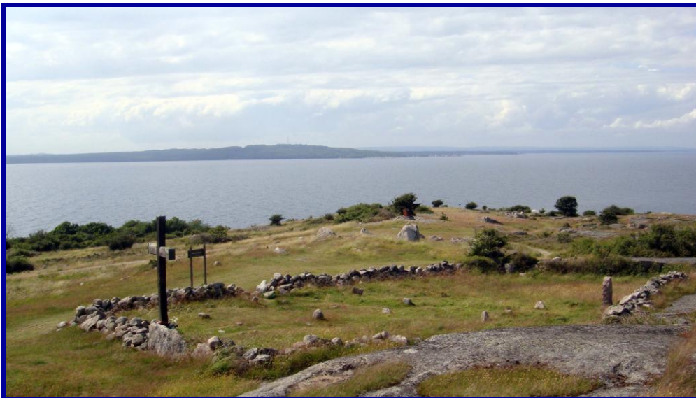
The cemetery at Hano

Sweden was of course neutral in both World Wars, and the graves reflect this. The casualties (150 named in total, plus several unidentified) are mostly of two kinds: casualties from the battle of Jutland, washed ashore in the aftermath, and aircrew from WWII whose planes crashed in Sweden after being damaged over Germany, Norway or Denmark.