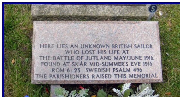
Bokenas old church and Jutland headstone