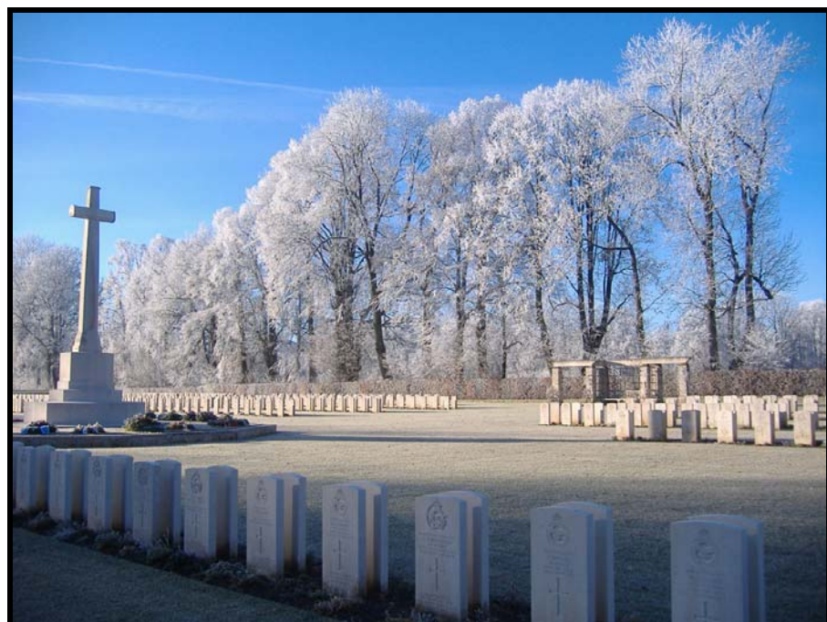
Durnbach War Cemetery, Germany

From the views of the cemetery in St. Symphorien it appeared that all of the headstones had been replaced with newly engraved ones including those of the German casualties in the same cemetery. I guess that this will be one location that many will visit during pilgrimages to the area by those now moved to visit the battlefields of France and Flanders.