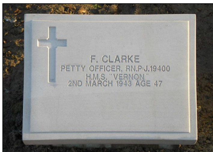
A new 'Gallipoli' style headstone being erected in some UK Cemeteries

When our Regional Supervisors have identified a PM not adequately commemorating a casualty we look to replace the PM with a CH. It is in fact the burial rights (BR) owner who can decide on what is placed on top of the grave. This is not necessarily the same person as the NOK. In some instances we ourselves are the BR owner. However, in all cases we appeal for the NOK as a courtesy as they are the one's usually affected most deeply by any change to a grave. It is usually possible to obtain the permission of the relevant burial authority, but contacting the grave owner or casualty's next of kin can often be more challenging.