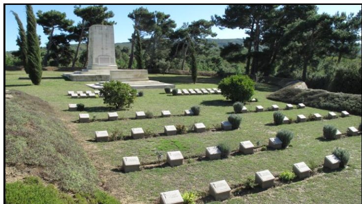
Hill 60, Gallipoli

I promised my grandmother on her 95th birthday that I would try my hardest to find her a picture of her father's grave after apologising for putting money in her birthday card as I didn't know what to get her. She had smiled and said, 'Silly girl, a card is enough, what do I want at my age?' My suggestion of a rub down with the Sporting Life or a massage with Vick brought a laugh and then she said, 'If I could have anything I wished for, do you know what I'd ask for? A photo of my father's grave, and a way to send flowers I don't know where to send any or if the grave is even marked. He died when I was three you know, in the 1st World War, he was a Colour Sergeant in the South Wales Borderers, he fought in Gallipoli and he was killed on 9th August 1915, a couple of months before my 4th birthday.' Then she took his army photo out of her purse and showed me it, saying "he's buried at hill 60" . Nan didn't know if he was in a cemetery or if he was buried where he fell, just that he was somewhere on Hill 60.