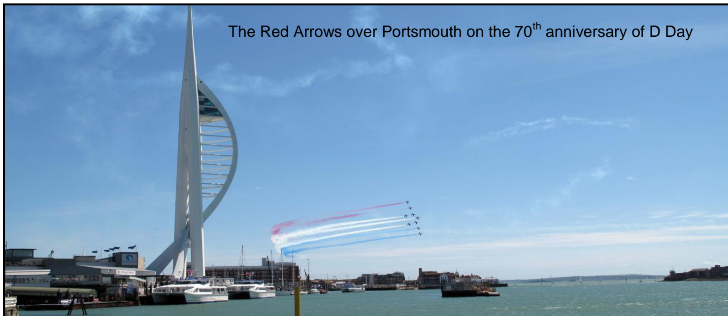
The Red Arrows over Portsmouth on the 70 th anniversary of D Day